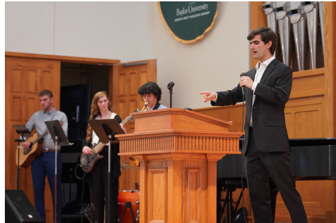
Church Music students lead worship at the Fall 2023 CCMS Advisory Board Meeting

Building Bridges to the Future will complete its fifth year of work in February 2024. In 2023, the scope of this project expanded to offer in-person worship workshops in Texas and South Carolina. These workshops allow us to